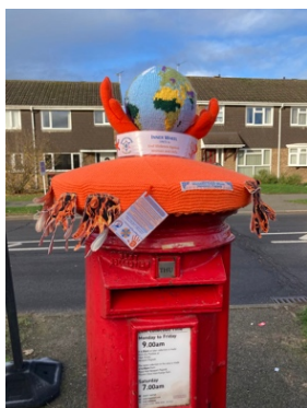
Newport Pagnell Postbox