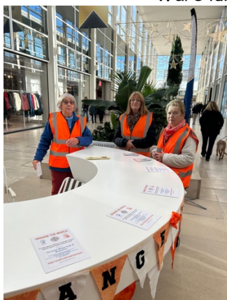
M K Shopping Centre Wolverton