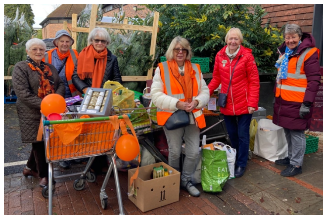
Harpenden Waitrose food collection