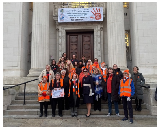
Outside the Town Hall