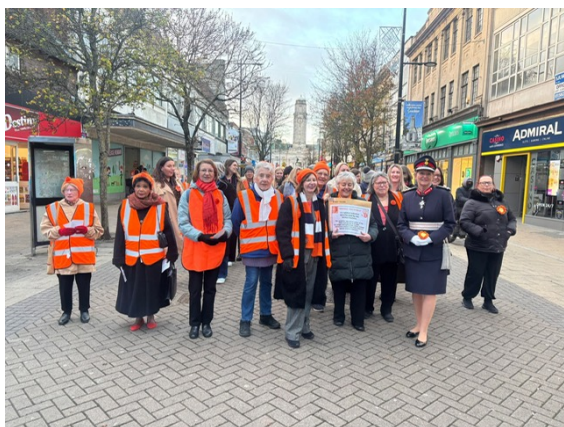
Luton Town Centre