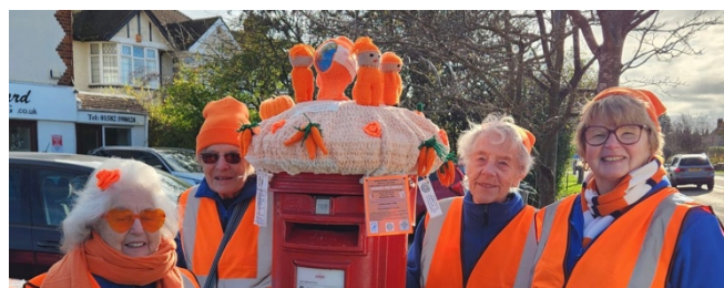
Luton North yarnbombers