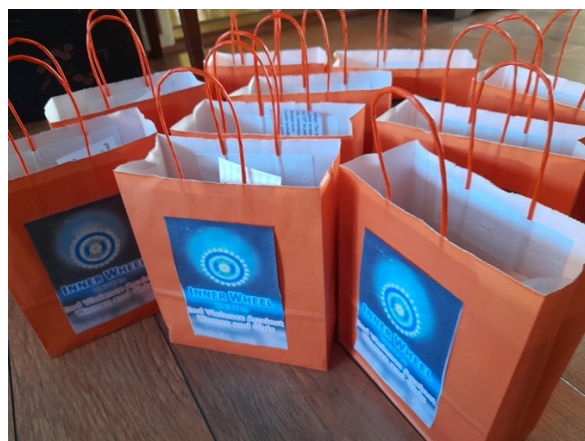
Amphill Goody bags.