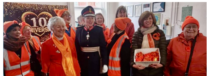
Luton Women's Refuge