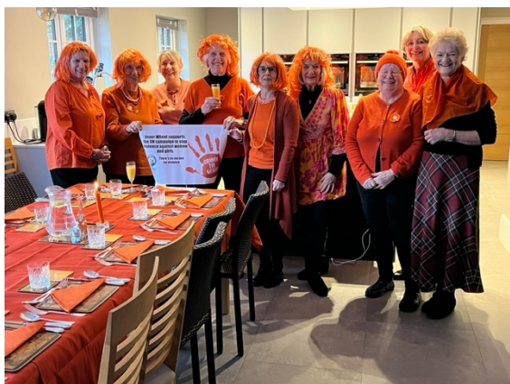
Ware lunch party