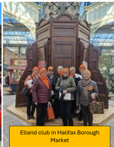
Elland club in Halifax Borough Market