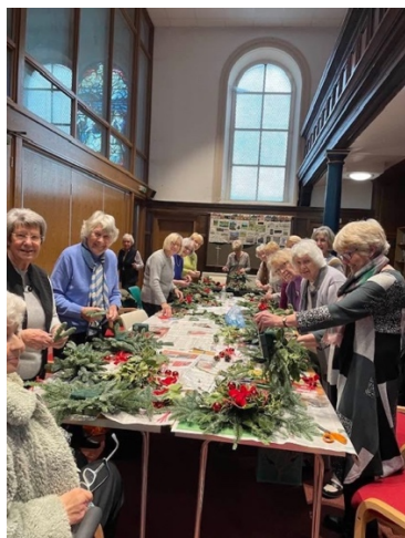
Learning a new craft!