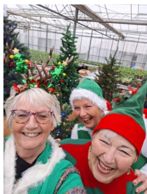
D22 enjoying a Christmas outing.

Celebrating Membership is so important. Many Clubs and Districts do this by the Presentation of certificates.