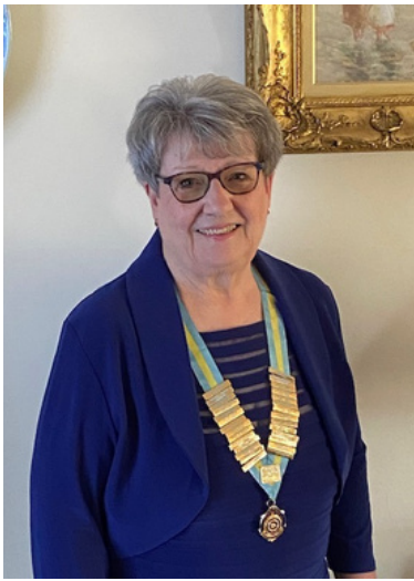
Inner Wheel District 1 Chairman 2024-25

And so into June . . . my final month as your DC.