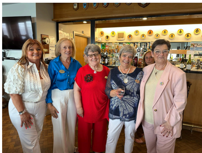
with the D16 Exec & Carrickfergus members