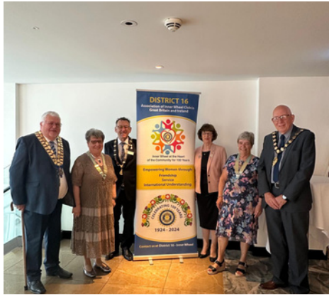
Top Table Guests