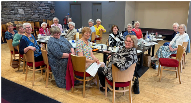
Forfar Club members in the Royal at their meeting - the room looking very different without the Rally finery and decor!

Wednesday 18 th June - Forfar Inner Wheel Club Meeting and AGM - the last meeting before our summer break. Reports were heard of a busy but very successful year - with a fashion show raising funds for 9 local charities; a huge collection of goods for Ukraine via TASH; and coffee mornings/afternoons for Arthritis Action and the RNLI. In addition the club had celebrated its 75th Birthday in February . Everyone had enjoyed the recent District Rally held in Forfar and the club and hotel has received many compliments from visitors. I was able to thank the club for everything they have done to support me this year.