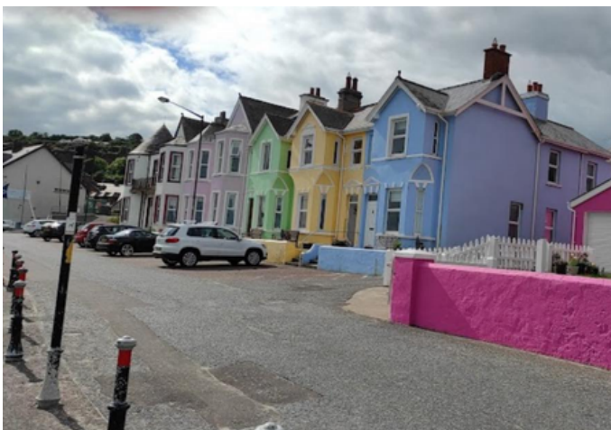
Painted houses - Whitehead