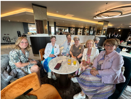
Cocktails or mocktails !??