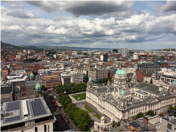
the incredible view from the 23 rd floor!

..... and then the ferry back that evening to Scotland!