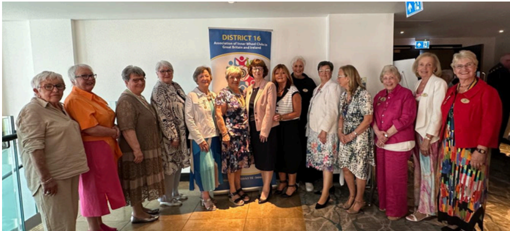
with a group of attendees