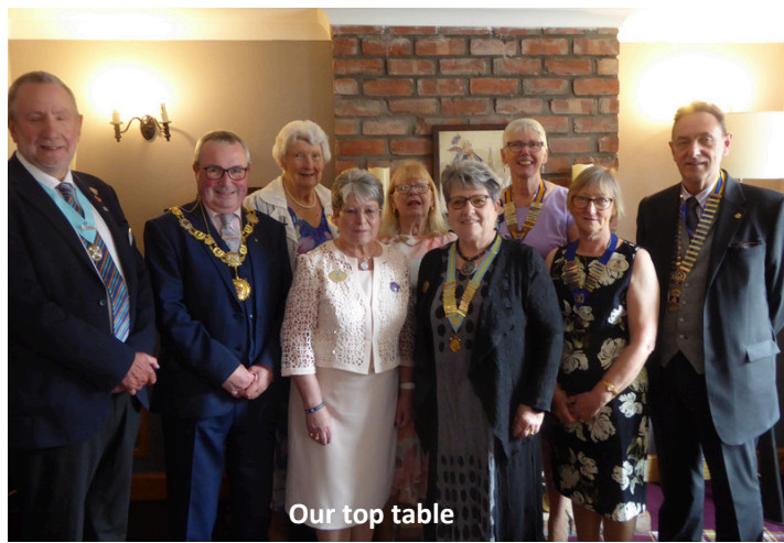
Our top table