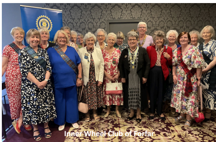
Inner Wheel Club of Forfar