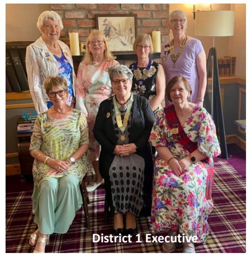
District 1 Executive