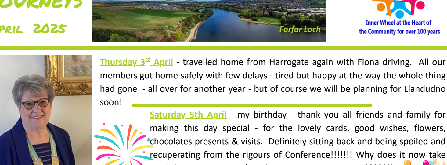
had gone - all over for another year - but of course we will be planning for Llandudno Saturday 5th April - my birthday - thank you all friends and family for making this day special - for the lovely cards, good wishes, flowers, Chocolates presents & visits. Definitely sitting back and being spoiled and

recuperating from the rigours of Conference!!!!!!! Why does it now take much longer to recover from big events ......?????!!!