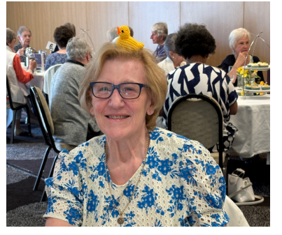
These chickens lay eggs anywhere!