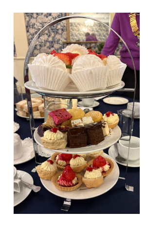
Other pics from the day.