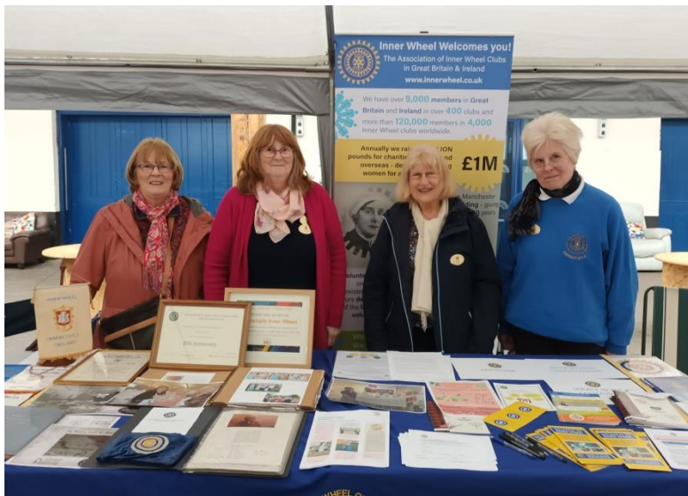
At the Pannier Market

A few days later, on Saturday March 8 th our club had a table in the Pannier Market in Barnstaple as part of an event to promote women's organisations on International Women's Day. There was a reasonable amount of interest and it was surprising to find that so few people knew about IW.