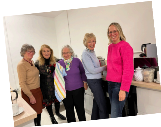
ABERFELDY & DISTRICT