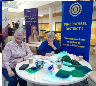
LAURENCEKIRK & DISTRICT