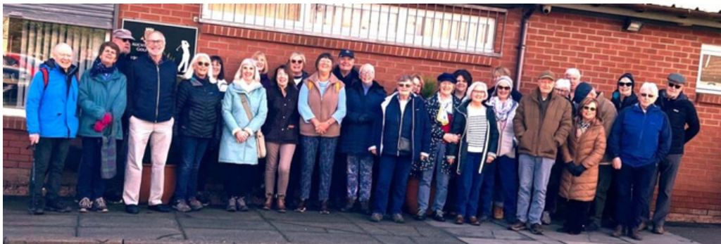
AUCHTERARDER & DISTRICT

Inner Wheel at the Heart of the Community for over 100 years