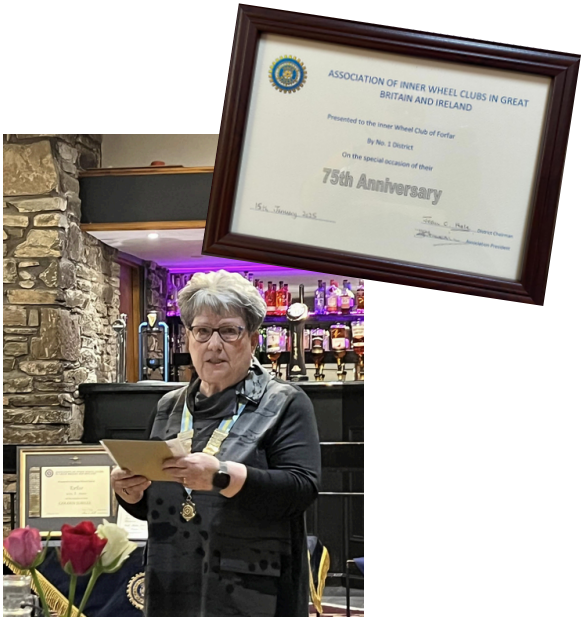
Above & below - all of the company

“Today you celebrate 75 years filled with wisdom and countless memories. May this milestone be a reflection of all the joy you have given and a reminder of the legacy you have built. Here’s to a remarkable past, a vibrant present and a future full of many more adventures”.