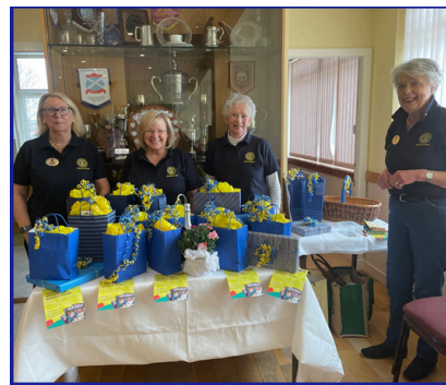
KINROSS & DISTRICT