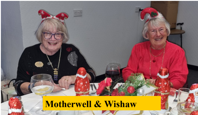
Motherwell & Wishaw