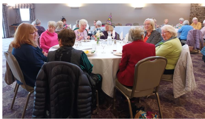
Socialising with members of Dartmouth Club