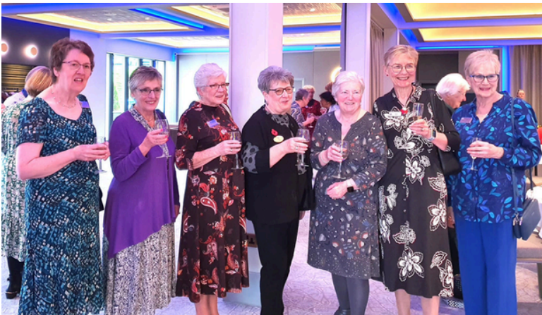
with the visitors from Inverness