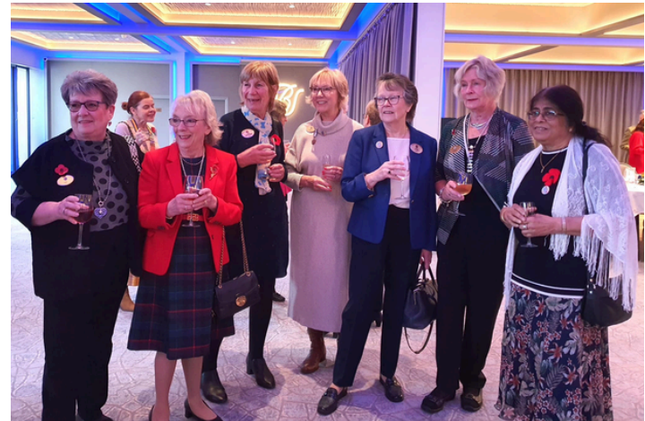
and from Aberdeen