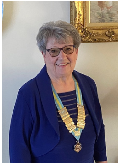
Inner Wheel District 1 Chairman 2024-25

Inner Wheel at the Heart of the Community for over 100 years