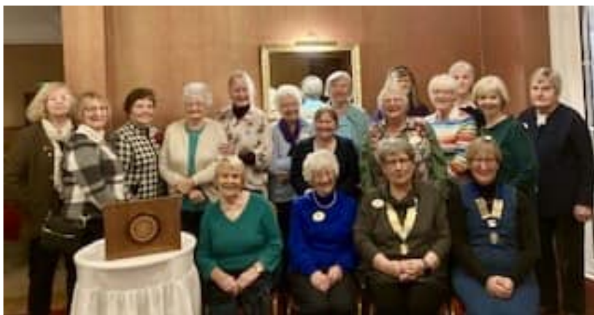
Photo with club members