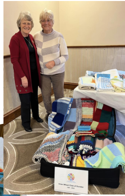
Members admiring all the wonderful hand-crafted goods