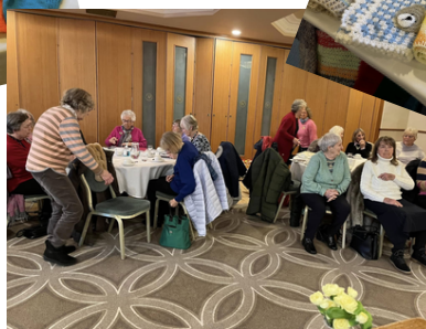
Members & guests