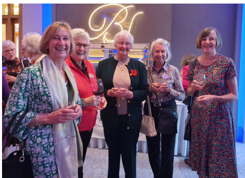
visitors from Ellon & Nairn