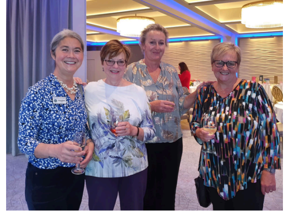
Some Banff members