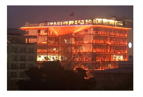
Fountains were lit up with candles in Italy & buildings lit up in orange around the world.