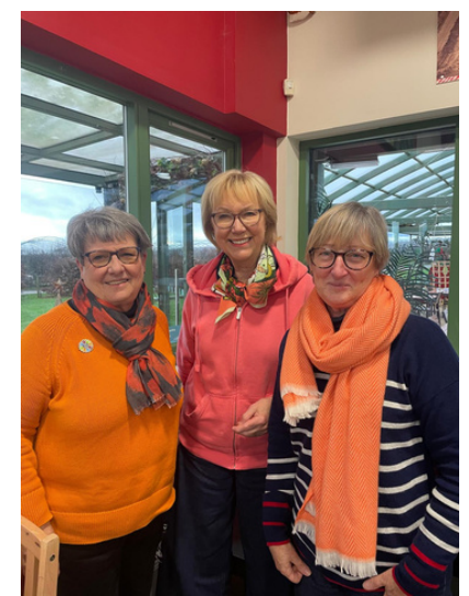
IIW President's message