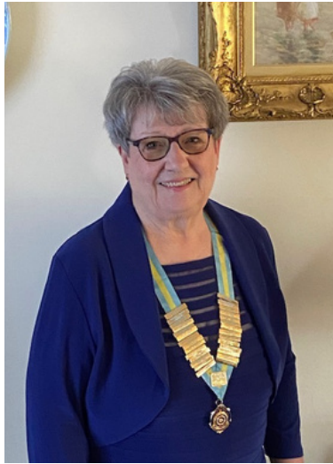
Inner Wheel District 1 Chairman 2024-25

Inner Wheel at the Heart of the Community for over 100 years