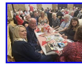
The Dukeries Wind Band