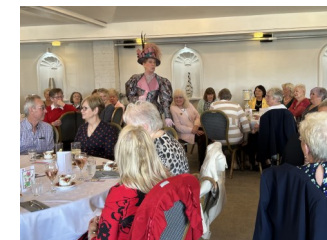
Baroness Bolsover instructing the audience in how to take tea!!