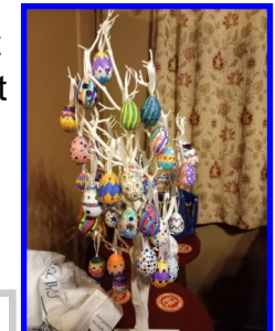
The fruits of their efforts on the egg tree

Later in March, we enjoyed a lovely evening at the invitation of the Church Wilne Club. We got in touch with our artistic side and decorated Easter eggs. Some were beautiful and were done with a lot of fun and friendship.