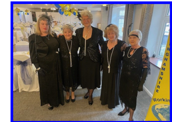
Some of Heanor's 1920's flappers

year celebration of Inner Wheel, Afternoon Tea and Vintage fashion show, getting dressed in 1920's fashion and putting on the glitz.