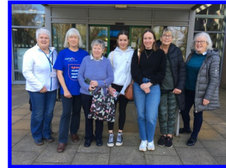
The successful swim team

We were really pleased to be able to enter a cross generational team in the Rotary Swimathon. The swim was very successful and monies raised are for the Bassetlaw Hospice and the Motor Neuron Disease Association (MNDA). Many thanks to our team and everyone who supported them.