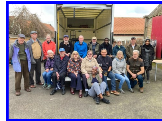
The team of packers

In the spring we welcomed a speaker from the local Riding for the Disabled group and we heard all about the wonderful horses, ponies and volunteers.