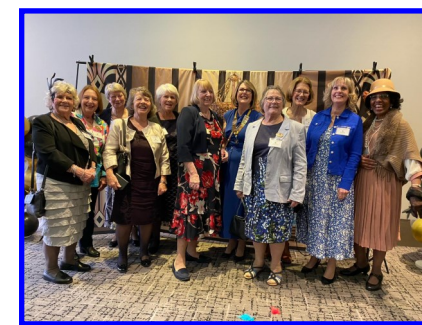
The ladies of Long Eaton at the Celebration Lunch with one member from Melbourne and one from Church Wilne

On the 15 th of April we celebrated 100 years of Inner Wheel in London. There were lots of clubs represented and it was very enjoyable to meet members from different districts. After lunch we were entertained by our local singer, Lily Taylor-Ward, always a delight to hear.