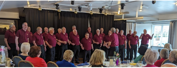
The Grand Central Chorus, four part harmony in full flow