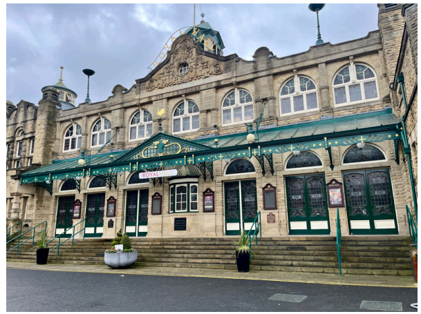
The Royal Hall - Conference venue - just down the road from our hotel, girls!