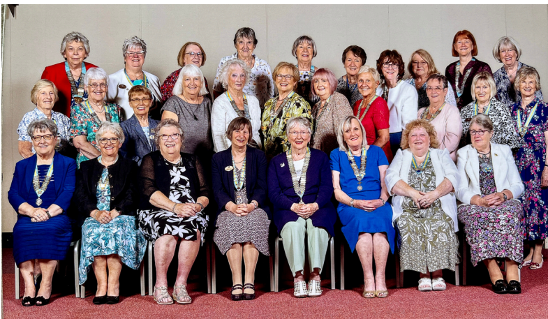
District Chairmen 2024 - 25 GB&I