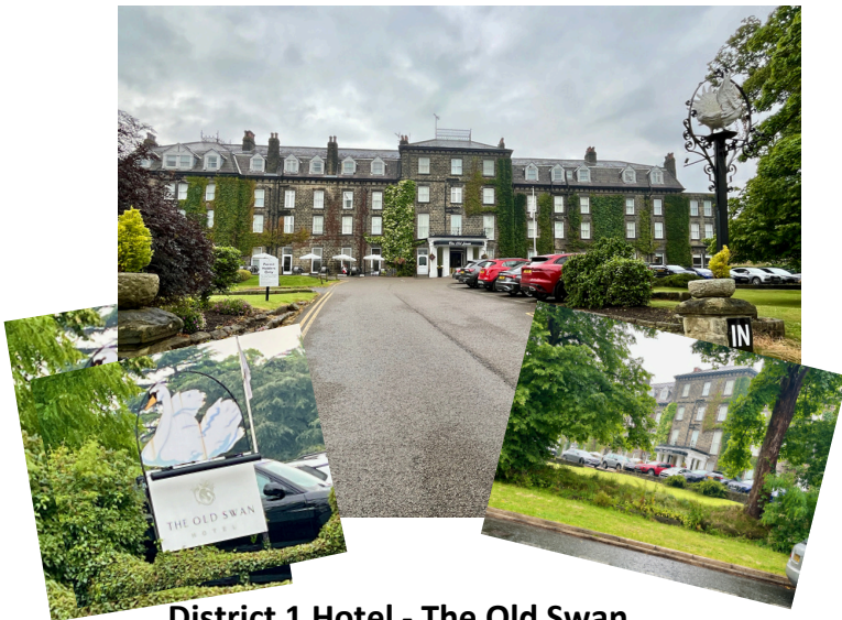
District 1 Hotel - The Old Swan - looks great