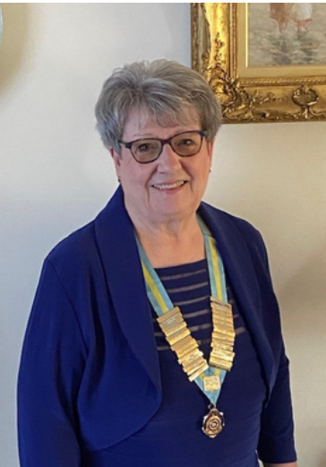
Inner Wheel District 1 Chairman 2024-25

Inner Wheel at the Heart of the Community for over 100 years