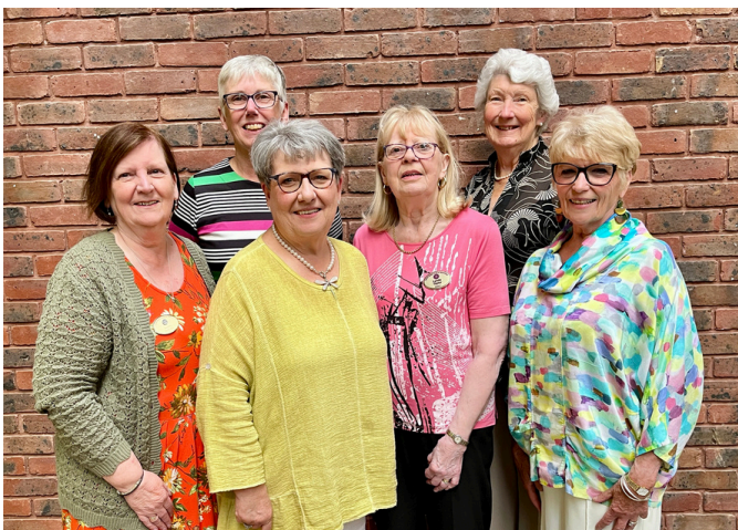
District 1 Executive at Yarnfield