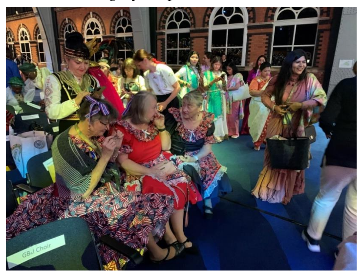
Some of the national costumes

The next morning my companion and I visited the House of Culture and the sales tables for a while, and later on