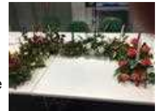
Efforts well rewarded