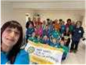
Kirkby-in-Ashfield recreating the first meeting