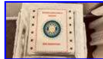
It was as good as it looks