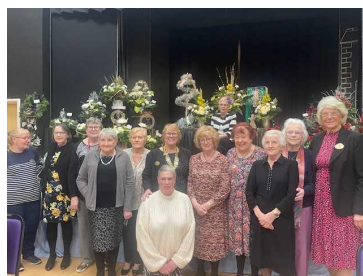
The Heanor Team

We welcomed three prospective members to our December meeting. A delicious buffet was enjoyed following a Show and Tell, where several members spoke of their memories and treasured items. We look forward to inducting three new members on Inner Wheel Day.