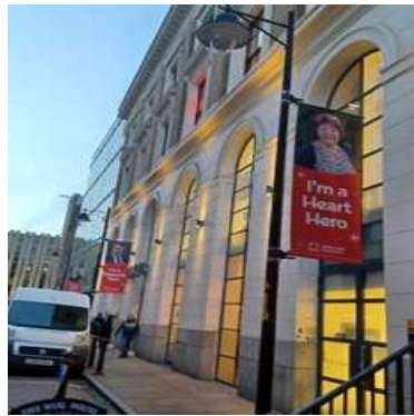
Pat's picture flies proud in London