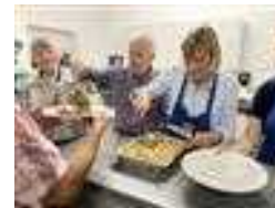
Pie and peas at the Ceilidh

We have had two charity fundraising events in as many months