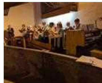
The District Choir