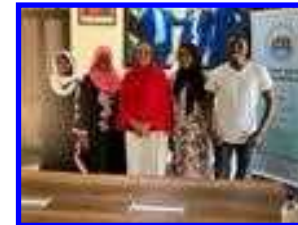
Young people sewing sanitary pads for the Pad Project in Zanzibar