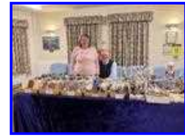
Lots of goodies to sample and buy