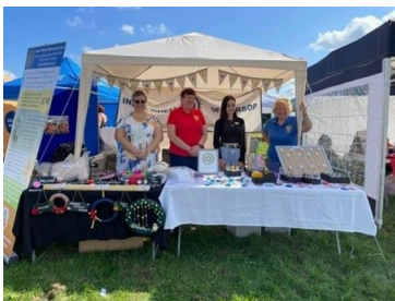
The stall at the Rhubarb Farm event.