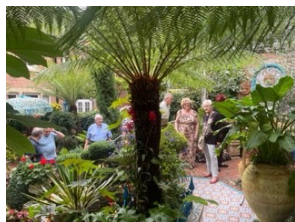
Mr Blood's amazing Italian gardens