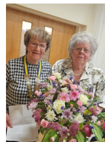
Passing on the baton at the AGM handover