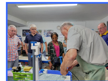
Photo: Checking for leaks