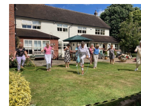
Skippers of Mansfield