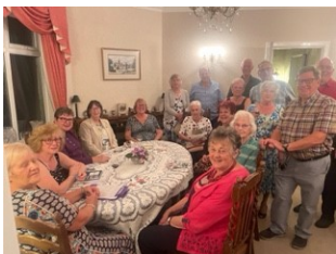
Fund raising with a Safari Supper