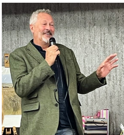
Celebrity Chef Nick Nairn