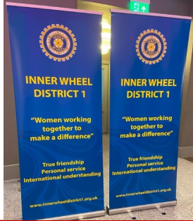
Borrow the D1 Banners

Here are some other ideas to make ourselves visible!