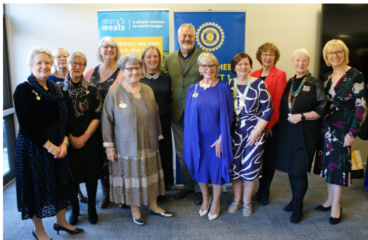
Top Table guests with the District Executive