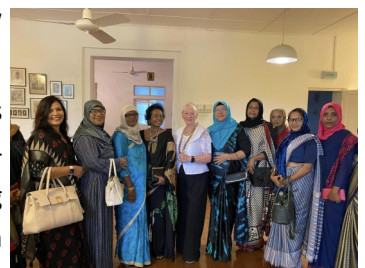
Pics. from Sri Lanka

There are more fabulous adventures planned for 2024 - culminating in us all meeting up again at the Convention in Manchester in May.