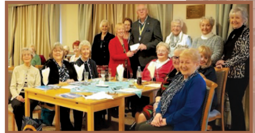
North West Air Ambulance Charity