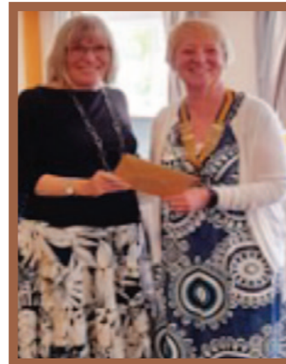
Riding for the Disabled