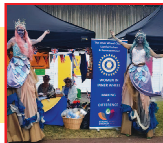
Llanfairfechan & Penmaenmawr