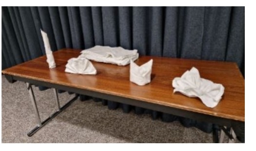
And in Blue Peter style "these are the ones they made earlier"

wished each other a safe journey home. Thank you everyone for coming and making the evening so enjoyable