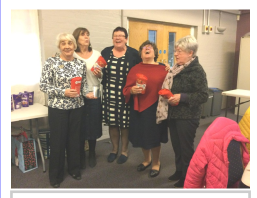
Congratulations to Sutton in Ashfield

21 teams battled it out on 21st February at the Ashwood Centre at our annual quiz night. Again, as Inner Wheel does, there was copious amounts of food brought to the occasion and the evening was full of hilarity and fun. Obscure answers were given to some difficult questions, raising titters across the room. It's become a much loved event. Well done to the victors from Sutton in Ashfield with Ravenshead and Bolsover in a tie-break for second place. Well done Ravenshead, the 'gloves are off for next year!'