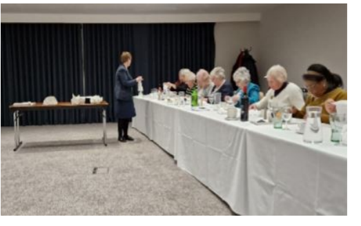
Deep in concentration