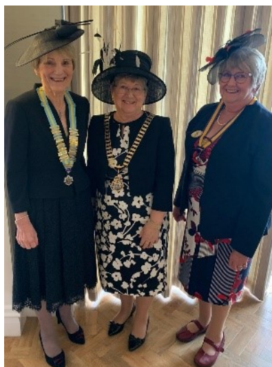
District 9 Rally 2021/2022